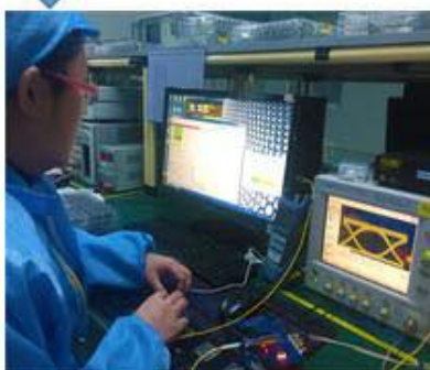
Product Initial Test