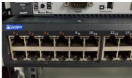
Juniper EX 4200