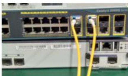
Cisco Catalyst 2960G