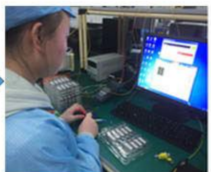
Product Final Test