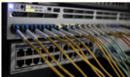
Cisco Catalyst 3850

Our test equipment: VOLKTEK MEN-4110, HP 2530-8G, CRS226-24G-25+RM, Catalyst 2960G Series, Catalyst 3850 XS 10G SFP+, Catalyst 3750-E Series, HUAWEI S5700Series, H3C S3100V2 Series, Juniper-EX4200, etc.