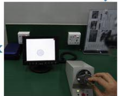
Cleaning end face