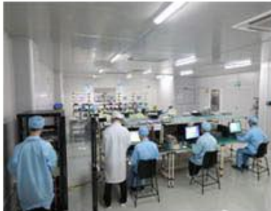
Standardized Production Line

Continuous introduction of new equipment, produced by strict standards, strict quality inspection, to guarantee the high quality standard of each product.