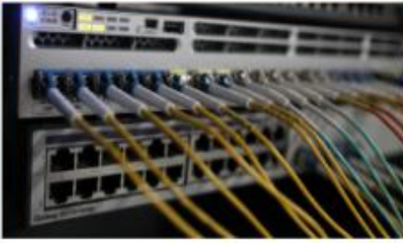
Cisco Catalyst 3850