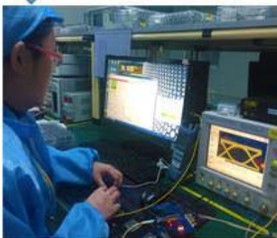
Product Initial Test