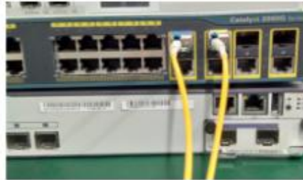
Cisco Catalyst 2960G