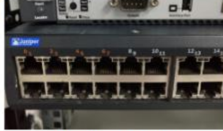
Juniper EX 4200